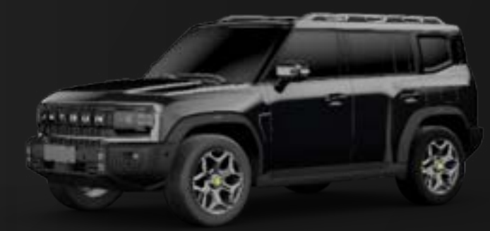
/// NIGHT BLACK