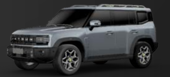
/// MISTY CYAN