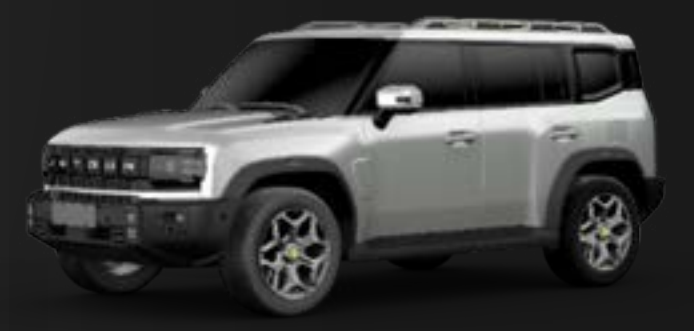
/// SILVER SNOW