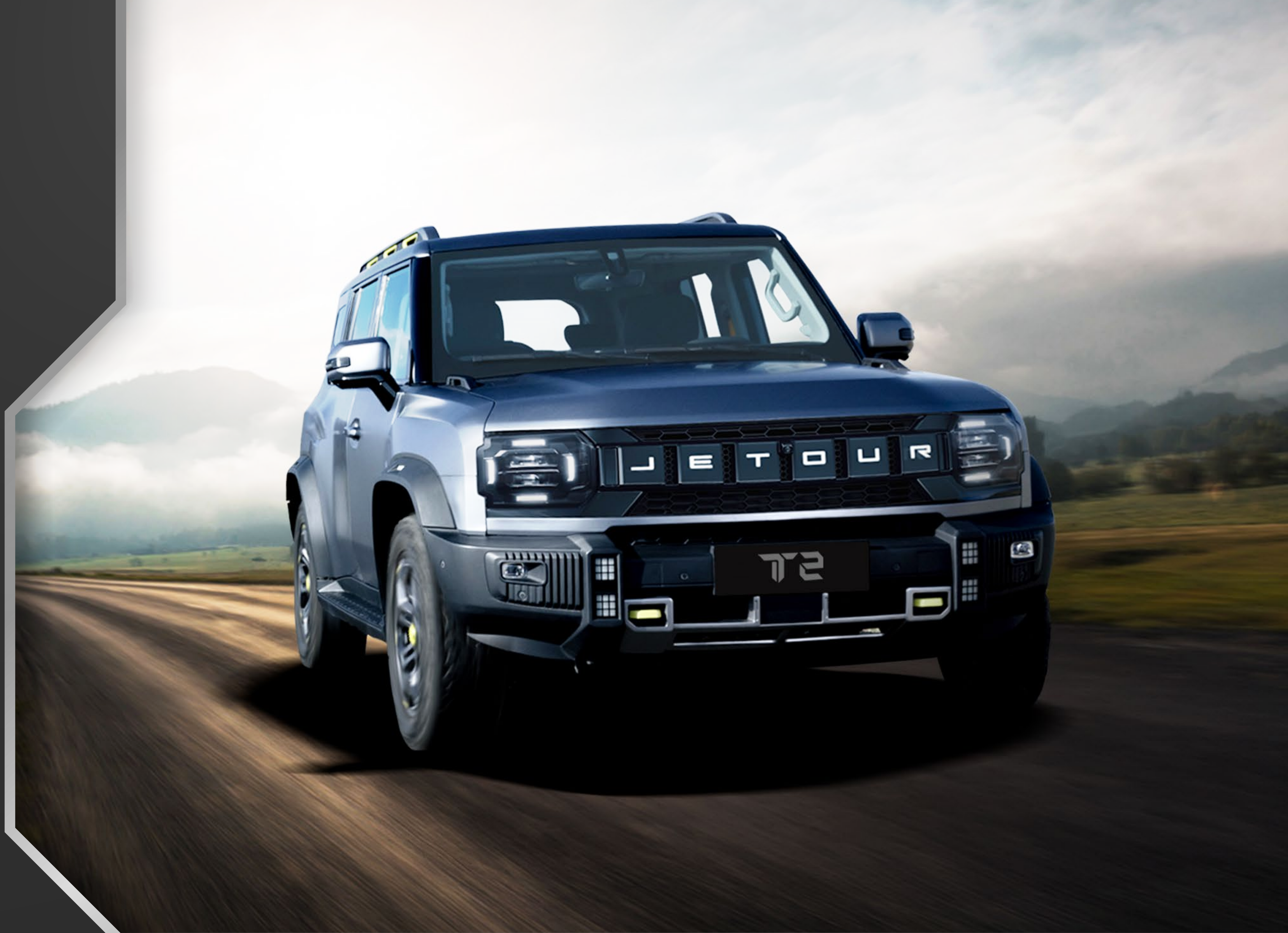
AUTOMATIC BRAKING SYSTEM