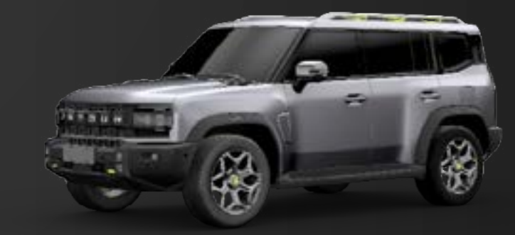
/// MATTE GREY